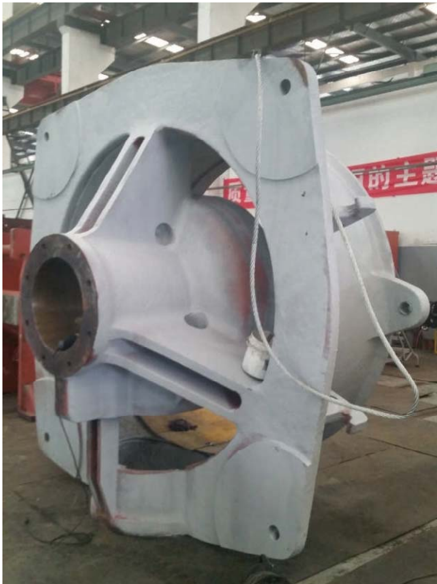
Figure 3 – Cone Crusher Main Frame at the Weir Factory outside Shanghai

The Altura design team spent almost two weeks at the DRA main design and drafting offices in Johannesburg in late February 2017 to monitor design development and provide guidance in key areas. They also visited key equipment suppliers in China in late March 2017 to conduct quality inspections during the manufacture process on critical pieces of equipment including crushers and the ball mill.