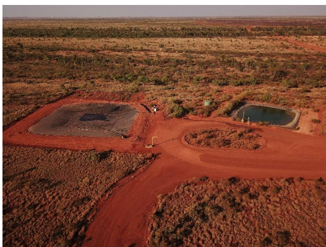
Photo 4. Altura Turkeys Nests

Pipeline work remains to be complete by year end to add this significant water source to our reserves and further de-risk the project.