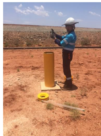
Photo 4. Water Monitoring at TSF

The monitoring covers pit, process plant, tailings storage facility, Chinnamoon Creek and, The Turner River