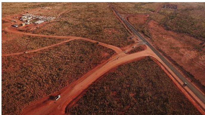
Photo 3. Intersection GNH and Pilgangoora Access Road

It's one of the steps in improving the efficiencies of haulage and is part of a package of measures designed to allow the use of larger trucks for exporting concentrate to port.