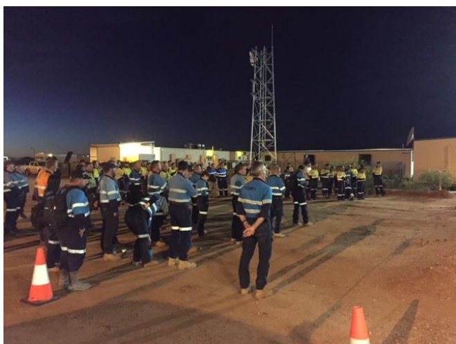
Photo 3. Dozens of People Gathered at the ANZAC Day Dawn Service