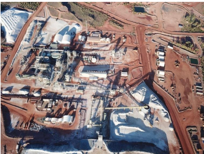
Photo 1. Altura Lithium Process Plant

April continued in a positive light with steady production, execution of improvement projects in the process plant, and shipping the forecast volumes for the month.