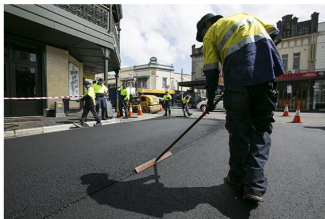
Photo 4. Downer employees completing roads works under the Close the Loop Banner.

Soft plastic waste will be used as asphalt additives to produce higher quality road surface.