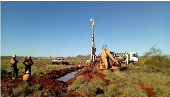
Photo 3. Successful drilling located near Altura Lithium

Additional water exploration work is planned for June-July and later this year, given the ongoing need to secure reliable water supplies via production water bores for mining and processing activities at the Altura Lithium Project.