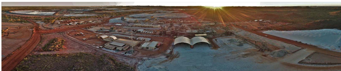
Photo 2. Panoramic View of the Altura Project